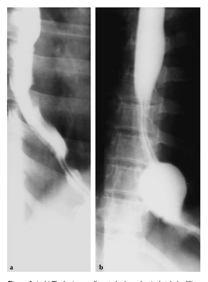
Figure 1. (a, b) The barium swallow study showed a single tubular filling defect in the long axis of the esophagus.

A 40-year-old male presented with a one week history of pain in the right hypochondrium. On physical examination slight jaundice was detected and there was tenderness on palpation in the right hypochondrium. The pathological laboratory findings are summarised in table 1. Ultrasonography revealed typical echogenic tubular filling defects along the long axis of the common bile duct, sometimes exhibiting slow movements and containing a central sonolucent line (fig. 2). As the patient's condition did not require urgent intervention, he was given mebendazole 100 mg day for three days. The nematode disappeared spontaneously from the common bile duct one week later at which time the jaundice regressed and the laboratory findings became normal by (tabl. 1).