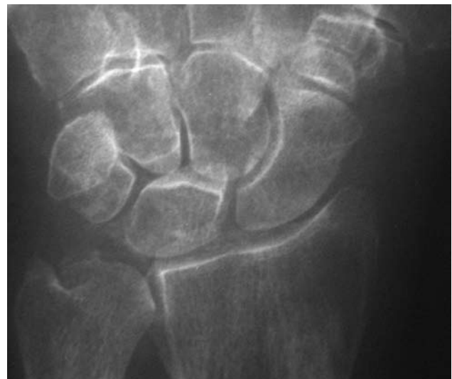
Figures 1 and 2 show the X-rays of the affected joints (right knee and left wrist joint respectively).

Diagnosis: Calcium pyrophosphate dihydrate crystal deposition disease (pseudogout).