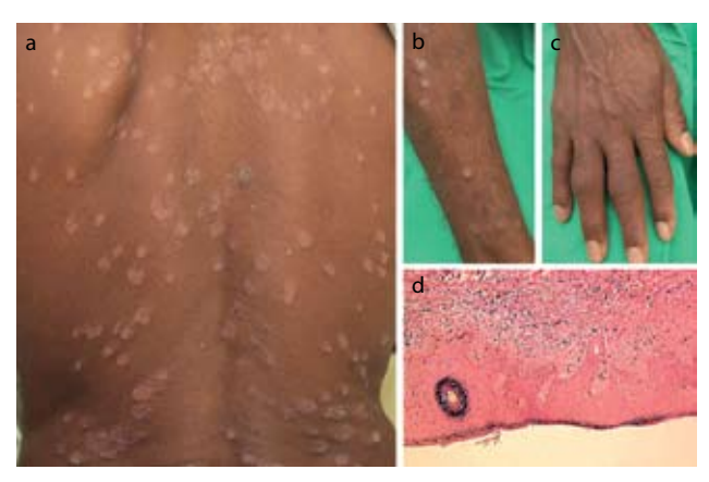
Figure 3. Psoriasiform skin lesions of patient 3 on the back (a) and arms (b). Arthritis of right and left fingers (c). Skin biopsy from a psoriasiform lesion in the arm of patient 3, demonstrating chronic inflammation (d).

Leukemia cutis (LC) is the infiltration of neoplastic leukocytes or their precursors into the epidermis, the dermis or the subcutis, resulting in clinically identifiable