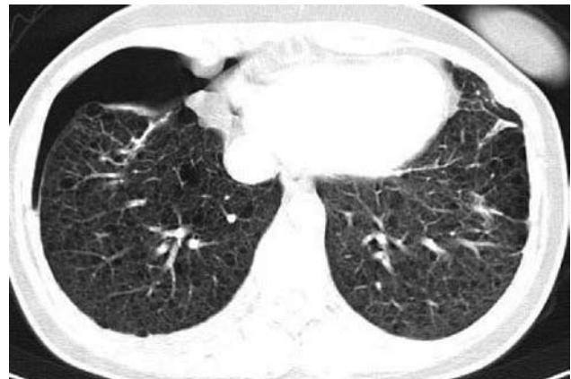
Figure 2. CT scan of the lung demonstrated small pleural effusion and pneumothorax of the right lung.

Department of Radiology, "Sotiria" General Hospital of Chest Diseases, Athens, Greece