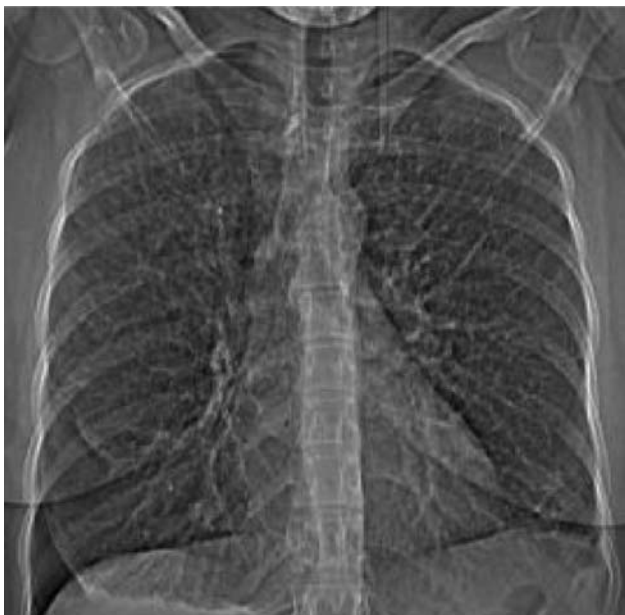
Figure 1. Normal chest radiograph upon admission.

Lymphangiomyomatosis (LAM) is a rare disorder of unknown