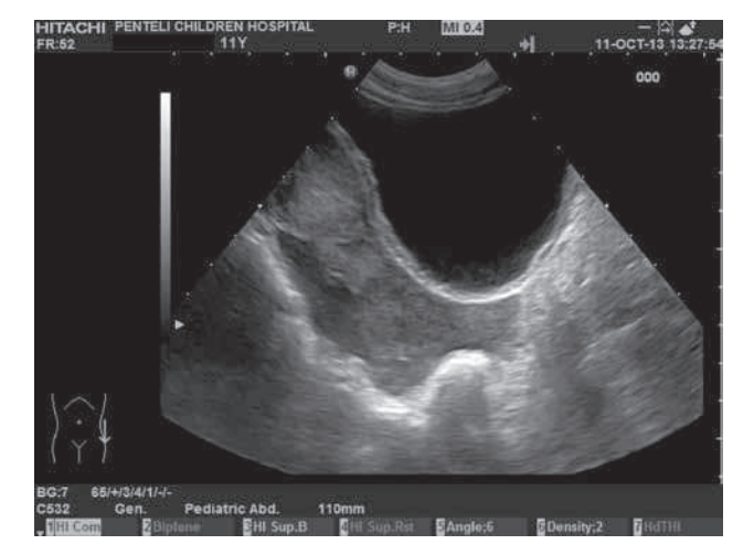
Figure 1. FAST (focused assessment with sonography in trauma) ultrasonography (US) (lower pelvis, sagittal view): Hyperechoic fluid collection, consistent with hemoperitoneum.

The spleen is the most frequently injured abdominal organ.