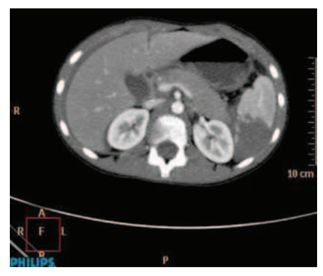
Figure 3. CECT of upper abdomen (axial view): Large portion of splenic parenchyma is hypoperfused; no contrast blush is noticed. Peritoneal fluid collection is observed (perihepatic space, Morrison recess and perisplenic space).

Delayed rupture of spleen may occur up to 10 days after trauma. Current management strives to avoid splenectomy. About 60% of patients with splenic injury do not have associated left lower rib fractures. The American Association for the Surgery of Trauma (AAST) had proposed a splenic CT injury grading scale (5 grades according to size of lacerations, subcapsular or central hematomas, splenic tissue maceration or devascularization), which is of limited clinical value since it does not predict the success rate of conservative management. On the other hand, the contrast extravasation has great impact of the patients' management; in the majority of such cases operative management is needed.