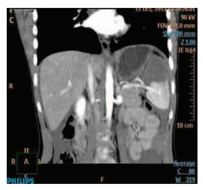
Figure 4. CECT of upper abdomen (coronal view): Note the hypoperfusion of upper pole of spleen and the normal enhancement of splenic artery.

Delayed rupture of spleen may occur up to 10 days after trauma. Current management strives to avoid splenectomy. About 60% of patients with splenic injury do not have associated left lower rib fractures. The American Association for the Surgery of Trauma (AAST) had proposed a splenic CT injury grading scale (5 grades according to size of lacerations, subcapsular or central hematomas, splenic tissue maceration or devascularization), which is of limited clinical value since it does not predict the success rate of conservative management. On the other hand, the contrast extravasation has great impact of the patients' management; in the majority of such cases operative management is needed.