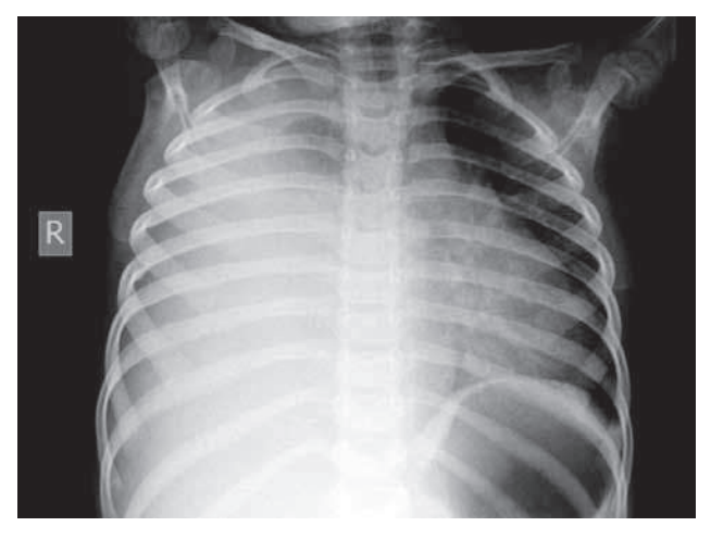
Figure 1. Chest X-ray: Opacification of right lung with contralateral mediastinal shift.

huge solid mass infiltrating pleura and lung parenchyma with significant mass effects: Passive atelectasis, mediastinal shift and hemidiaphragm inversion (figures 3, 4). Radiologic main diagnosis was made. Biopsy and histopathology was consistent with the radiologic diagnosis.