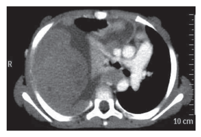
Figure 3. Chest CECT (contrast enhanced computed tomography): Axial view at the level of carina, that shows the presence of a solid mass occupying the right hemithorax causing lung atelectasis at the hilum and significant contralateral mediastinal shift of major vessels and airway.