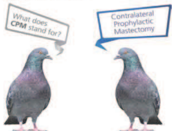
Figure 1. The recent increase in contralateral prophylactic mastectomy was a heavily debated issue in the 2014 San Antonio Breast Cancer Symposium.

Clinical Science Forum - Controversies and trends in contralateral prophylactic mastectomy (CPM)